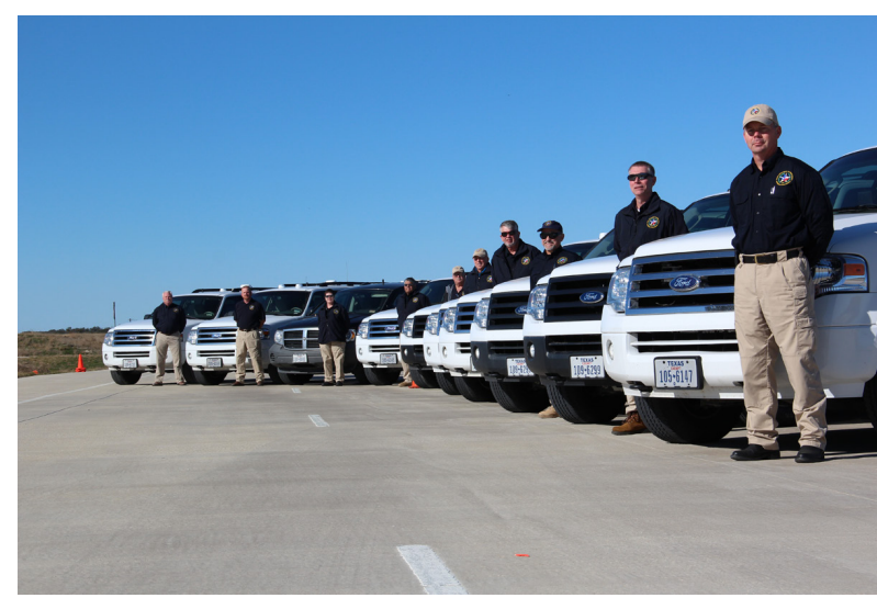
District and Regional Coordinators attend driver training at the DPS facility in Florence, Texas.

exercises, and developing emergency teams and facilities. They also teach a wide variety of emergency management training courses. In their response role, they deploy to incident sites to assess damage, identify urgent needs, advise local officials regarding state assistance, and coordinate deployment of state emergency resources to assist local emergency responders. District coordinators are included in Appendix C.