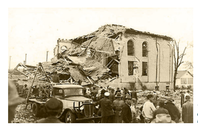
The New London, Texas School on March 18, 1937.