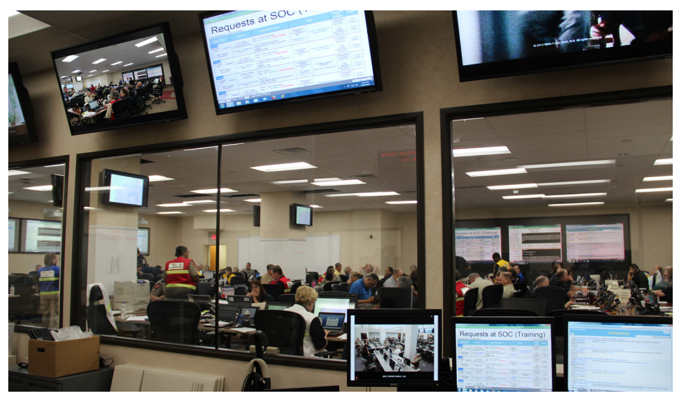
As seen from "The Bubble," members of the Emergency Management Council testing new systems at the newly renovated Jack Colley State Operations Center during a full-scale hurricane preparedness exercise.