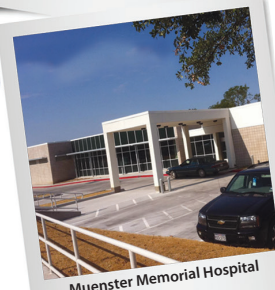
Muenster Memorial Hospital