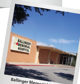
Ballinger Memorial Hospital