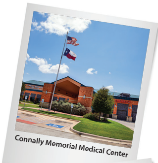
Connally Memorial Medical Center

Prepared by the Texas Organization of Rural & Community Hospitals